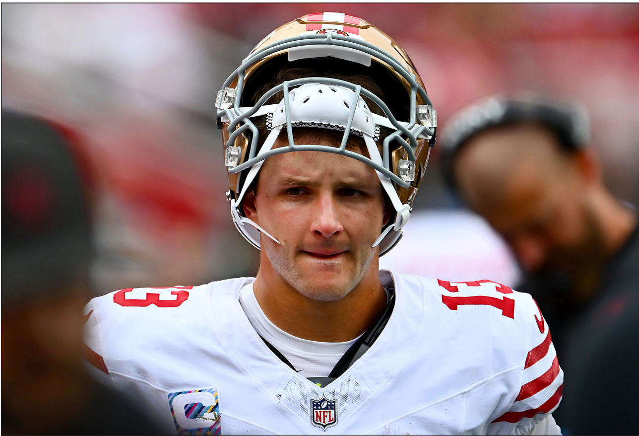
Quarterback Brock Purdy walks off the field after a fourth-quarter fumble cemented a 26-21 49ers' loss against the Jacksonville Jaguars on Sunday at Levi's Stadium in Santa Clara.