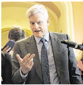
TOM BRENNER TNS

GOP-backed health savings accounts cover fancy saunas but not insurance premiums.