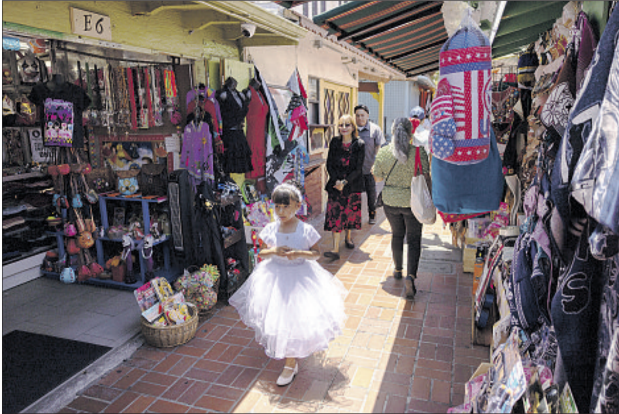
MEXICAN-OWNED stands and businesses line the street where the Los Angeles pueblo was born in 1781.