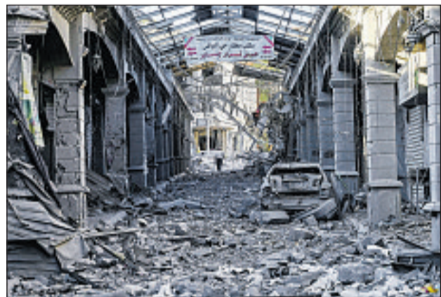
A MAN makes his way through the heavily damaged historic market of Nabatiyeh, Lebanon, on June 15.

NABATIYEH, Lebanon — Sweating under a powerful afternoon sun, the crowd slapped their chests in time with the chanter's cry, his mournful refrain echoing over the abandoned, rubble-lined streets of this wounded city that has been the focus of Israel's latest attacks in Lebanon.