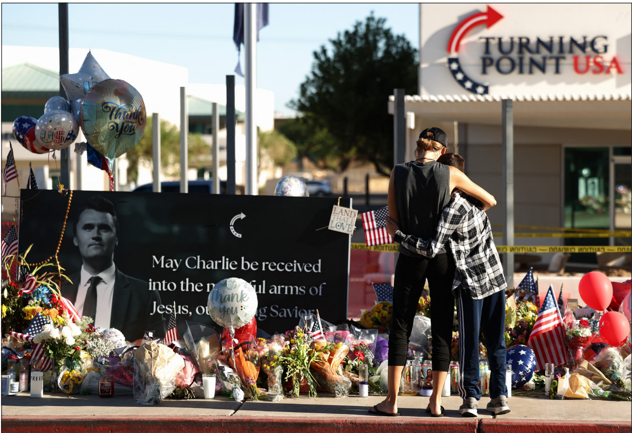
Arizonans mourn Turning Point USA co-founder Charlie Kirk, who was assassinated Wednesday, outside the nonprofit political organization's headquarters Friday in Phoenix.

Authorities say man opposed activist's views