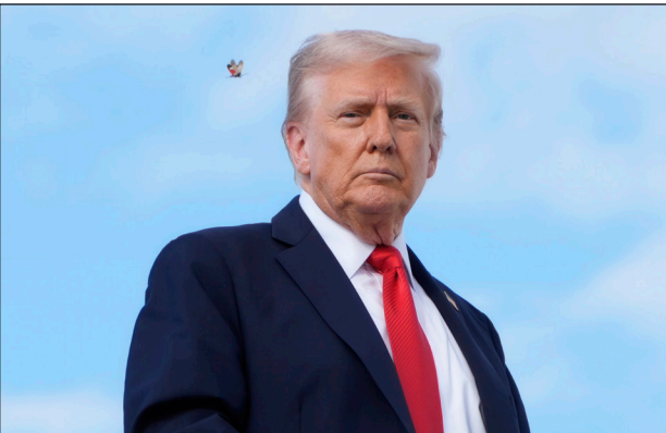
President Donald Trump, seen Thursday in Maryland, said Friday he'll send the National Guard to Memphis, Tenn., to address crime concerns there.

Visit myaccount.dailybulletin.com or call 909-987-9900. To place a classified ad, call 714-796-7983.