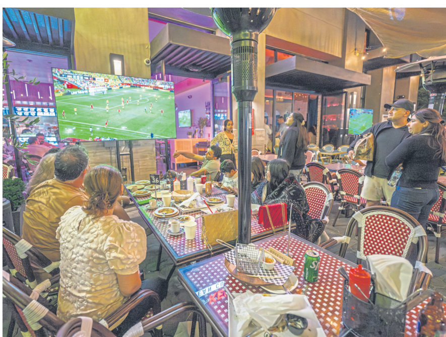
Soccer fans watch as Turkey plays Australia on Saturday at Sultan's Kebab. A contingent of Bay Area supporters plans to attend tonight's match in Santa Clara.