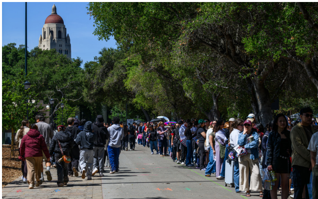
Thousands gathered at Stanford Stadium for K-pop boy band BTS' first tour since the group went on hiatus so its members could complete military service in South Korea.

been drawn to BTS since 2019, when she discovered the band's song "Mikrokosmos" would immediately calm down her son, who has