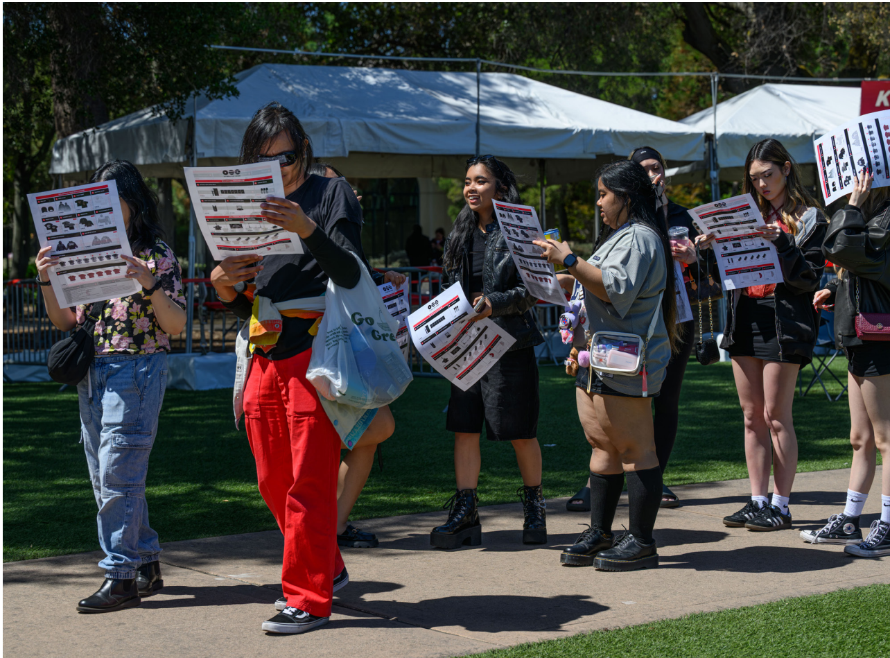
BTS fans look at a leaflet while waiting in line to purchase merchandise before Saturday's concert at Stanford Stadium. BTS will perform its third show Tuesday.