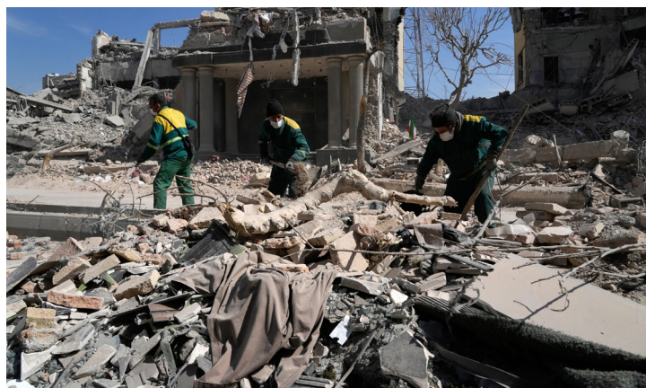
Workers remove piles of rubble from a police facility that was struck by missiles during the U.S.-Israeli military campaign being waged in Tehran, Iran, on Wednesday.

The tempo of the strikes on Iran was so intense that state television announced the mourning ceremony for Iranian Supreme Leader Ayatollah Ali Khamenei,