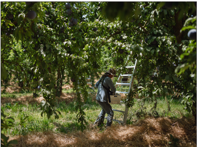
A farmworker picks plums in the fields of Fresno County. The Central Valley, home to a $60 billion agricultural industry, remains on edge amid mixed signals from the Trump administration about deportation.

vegetables and tree nuts grown in the United States and exports half of that bounty overseas. California agriculture overall is a $60 billion annual business. It is also one that President Donald Trump has thrown into turmoil. Only in recent weeks has he offered vague glimmers of hope. When agents from the Border Patrol and Immigration and Customs Enforcement turned up