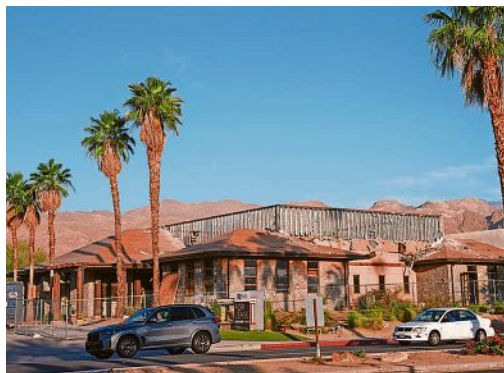
The owners of the Capital Grille chain have proposed opening a location at the building that was formerly Roy's Hawaiian Fusion restaurant in Rancho Mirage.

The former Roy's space had also previously been eyed as an expanded location for