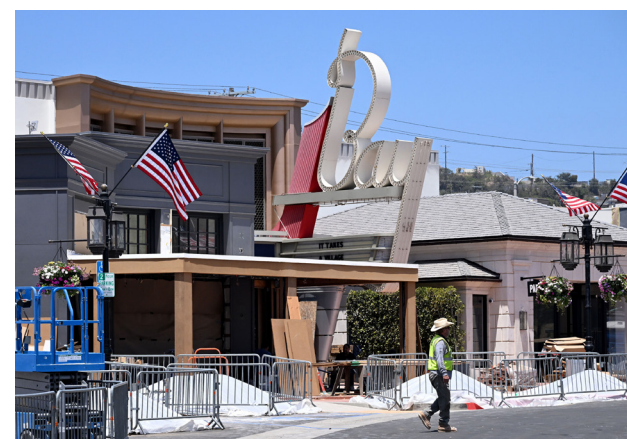
Construction work continues Thursday at Palisades Village, a shopping and dining center that closed following the 2025 Palisades fire.