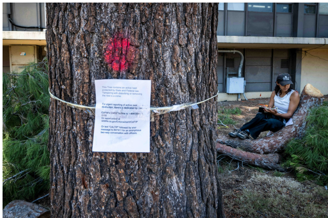
Nina Raj of the Altadena Seed Library sits on limbs of an Aleppo pine to stop a contractor from fully taking down the tree at Pasadena Unified School District's headquarters.

Local advocates say more than 70 trees at PUSD sites have been cut down in the first month of what is the district's summerlong plan to remove trees. Removals are part of the district's effort to remediate soil contaminated by last year's disastrous fire. The initial plan to remove 193 trees was reduced after action by the PUSD Board of Education