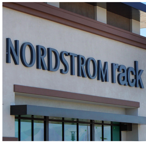
Nordstrom Rack is set to expand its presence in the Los Angeles area with plans to open new stores in Torrance and Marina del Rey.