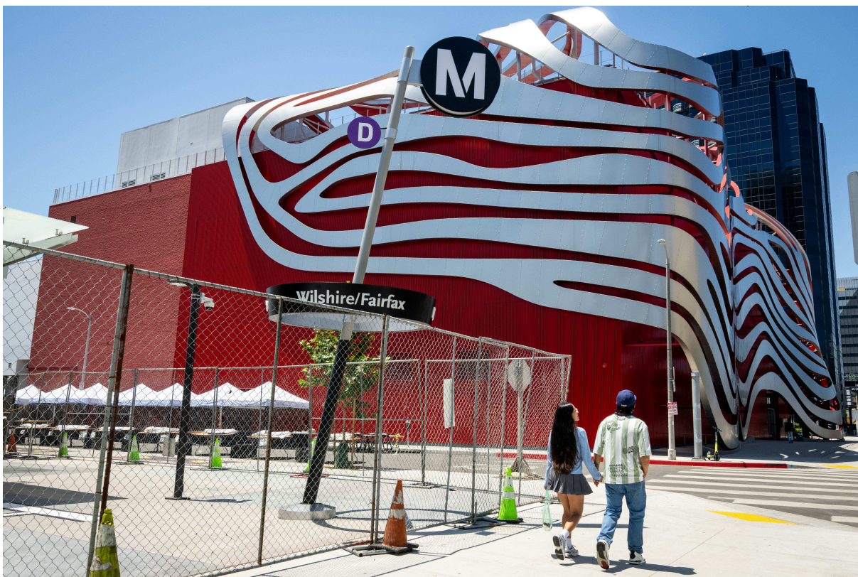
People pass the entrance to the underground L.A. Metro D Line's Wilshire/Fairfax station on Thursday just before the Petersen Automotive Museum on Wilshire Boulevard.

Initial 4-mile section heads west along Wilshire Boulevard, with 3 new stations