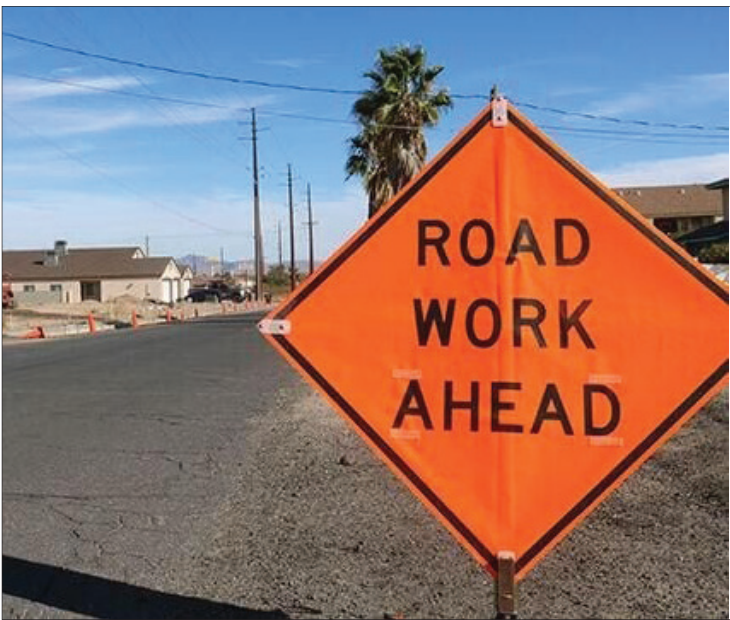
City of Kingman Work crews are currently wrapping up chip seal work in Residential District 2, and are expected to move on to District 3 around Sept. 24.