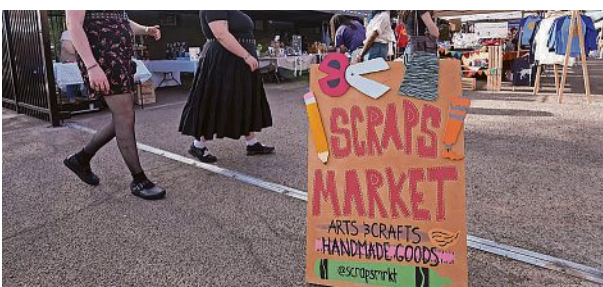
Scraps Market allows marketgoers to make crafts and interact with vendors to create custom goods.