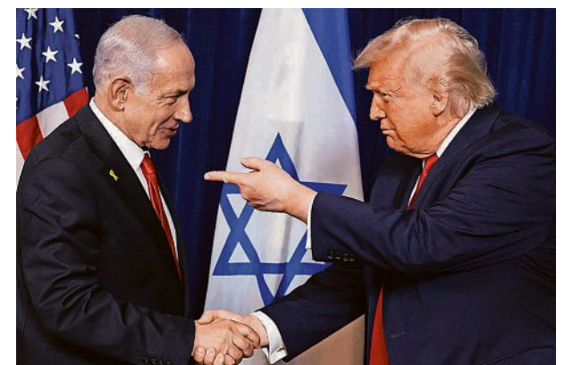
On June 3, Israeli Prime Minister Benjamin Netanyahu downplayed a heated exchange with President Donald Trump, saying that, while there may be "technical disagreements," the two leaders "agree on most things."