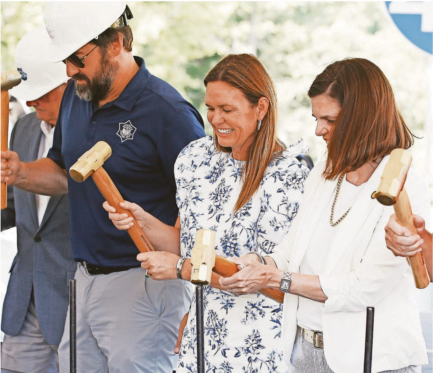
Arkansas Gov. Sarah Huckabee Sanders, middle, hammers a spike during the groundbreaking in Barling for the I-49 bridge that will serve part of the corridor to connect Kansas City to New Orleans on Aug. 22.