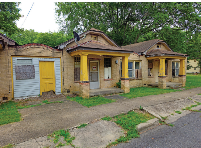
The Bellaire Apartments bungalows fronting Magnolia Street are shown.