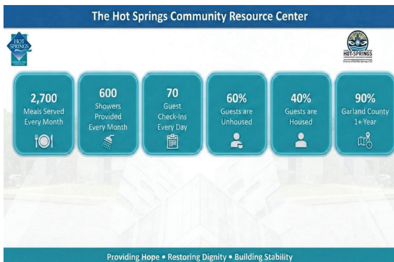
A slide from Ryan Kaundart's presentation on the cost avoidance analysis of the Hot Springs Community Resource Center shows some of the key numbers from the facility's first year of service.