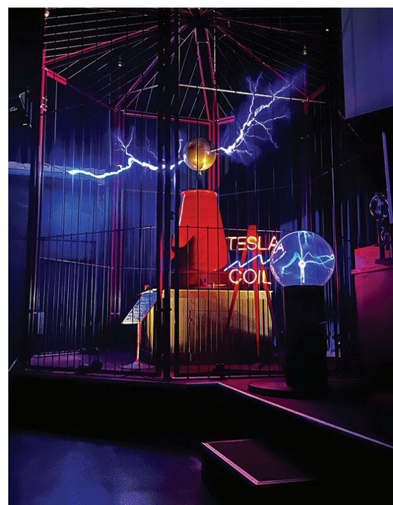
The most powerful conical Tesla coil that is on public display, according to the Guinness Book of World Records, is shown at the Mid-America Science Museum.