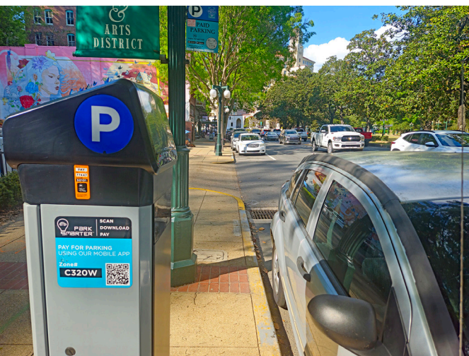
A parking kiosk on upper Central Avenue is one of the roughly two dozen in the city's managed parking area. The more than $100,000 in parking fees the city collected in March was the most since managed parking took effect in February of last year.