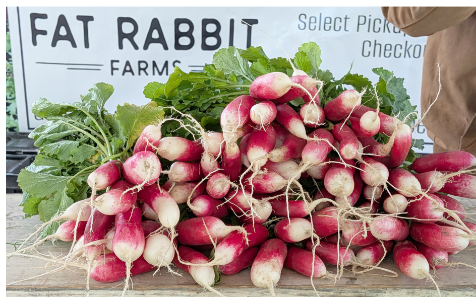
Radishes from Fat Rabbit Farms looked almost too good to eat and they were hard to resist at the Green Market opening day on May 7 at Grove Park. Green Market will be open from 8 a.m. to 12 noon each Thursday from now through the end of September.

It was a chilly morning, but at least the sun was shining, and there was an air of expectation as vendors arrived and set out their wares for opening day of the HSV Green Market Thursday, May 7, at Grove Park. Even though some growers said it was a bit early in the season to have a full complement of fresh vegetables, they promised that plants are in the ground and that future harvests will yield all the favorites – squash, carrots, a wide variety of greens and seasonal favorites.