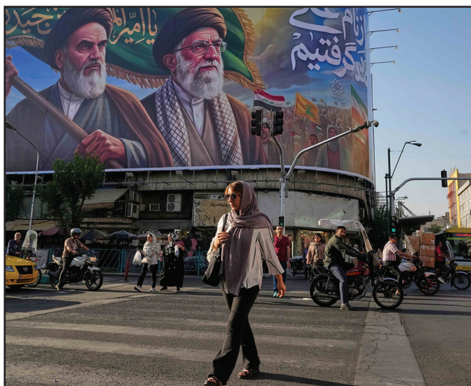
People walk under a banner Saturday showing portraits of the late revolutionary founder Ayatollah Khomeini (left) and the slain Supreme Leader Ayatollah Ali Khamenei, who was killed in U.S. and Israeli strikes on Feb. 28, in Tehran, Iran.