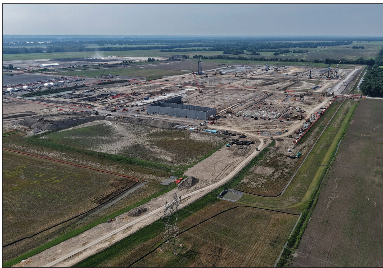
Construction continues on Monday at Google's more than 1,100-acre data center site in West Memphis.