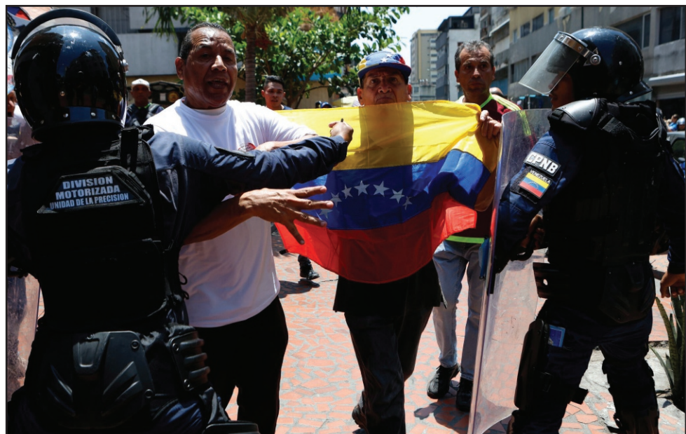
Bolivarian National Police stop protesters who are demanding higher salaries, pensions and benefits from continuing their march to the Miraflores Presidential Palace in Caracas, Venezuela, on Thursday.