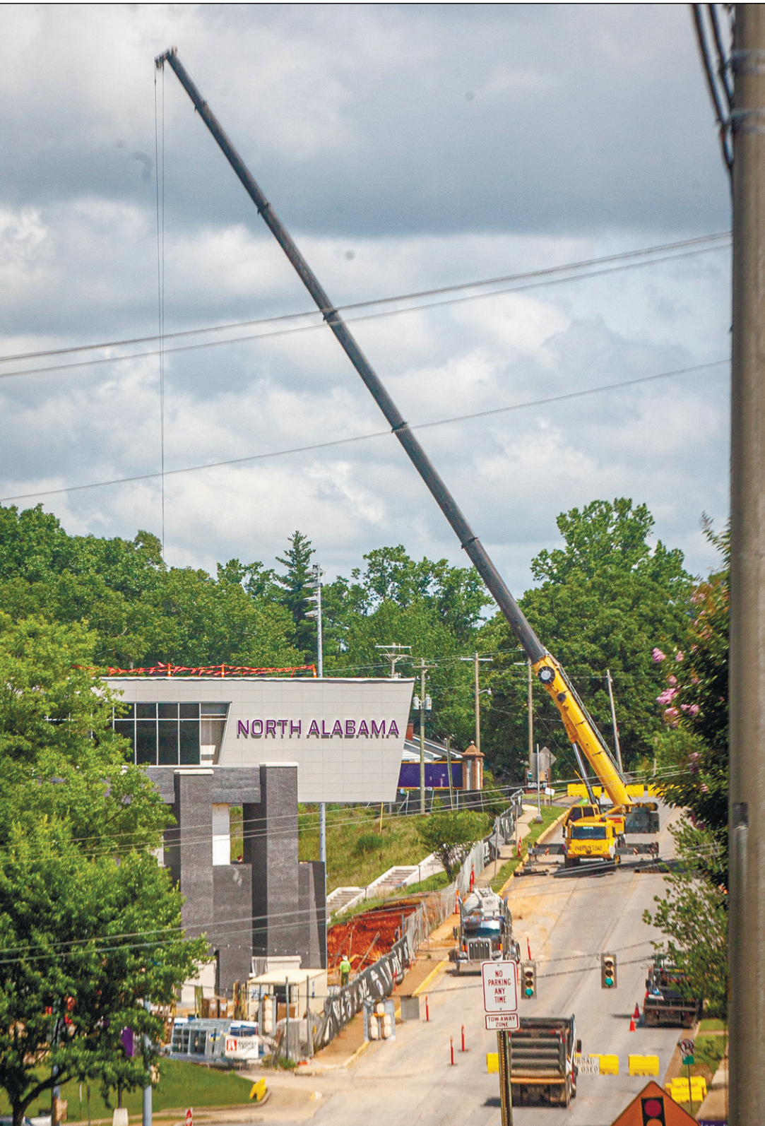
A crane boom extends over Pine Street near the University of North Alabama as crews work Thursday to install speakers on the video scoreboard at the new Bank Independent Stadium in Florence.