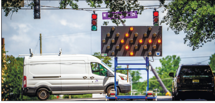
A detour arrow board directs traffic at the intersection of Irvine Avenue and North Pine Street near the University of North Alabama campus as Pine Street is closed Thursday in Florence to allow crews to install speakers on the video scoreboard at the new Bank Independent Stadium.