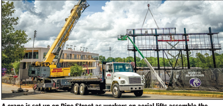
A crane is set up on Pine Street as workers on aerial lifts assemble the video scoreboard structure at the new Bank Independent Stadium on the University of North Alabama campus Thursday in Florence. Pine Street was closed to allow the crane to hoist speaker equipment for the scoreboard.