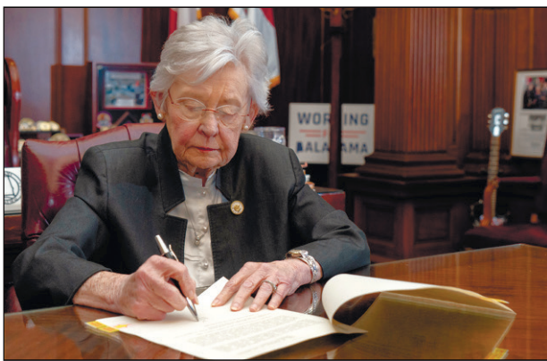
Gov. Kay Ivey on Tuesday signs the proclamation calling for a special election for the 1st, 2nd, 6th and 7th U.S. Congressional districts in the state. The special primary is scheduled for Aug. 11.