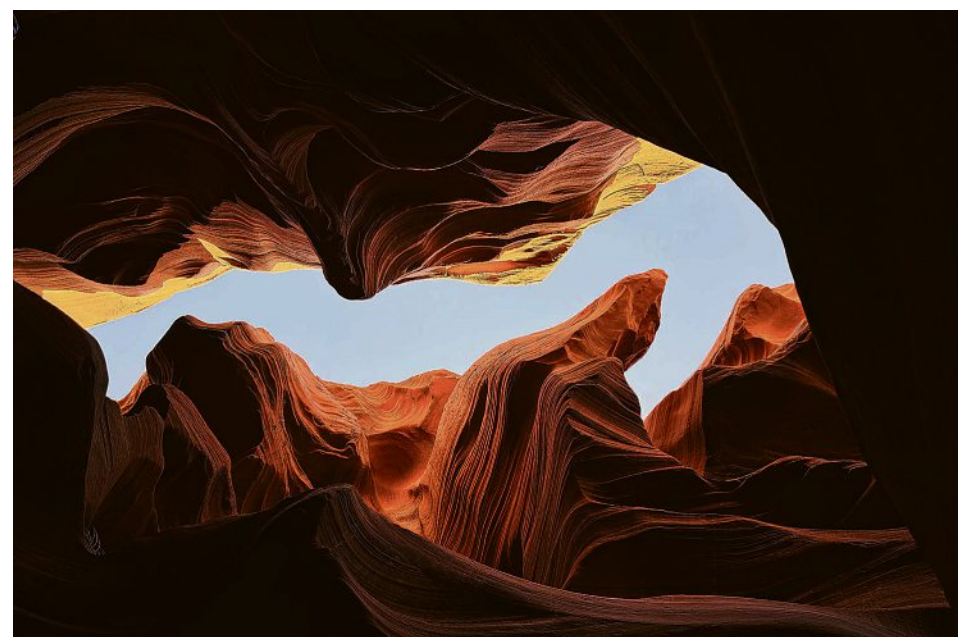
Visitors to the Great American State Fair in Washington, DC, will be able to walk through a space resembling the wavy sandstone walls of Antelope Canyon in Arizona with slivers of light shining on them from above.