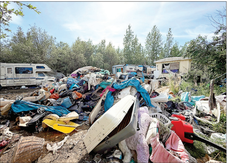
An aerial drone view shows the cleanup efforts by Fairbanks North Star Borough contractors to clean up a "junkyard" property on Badger Road on Aug. 13.

After 46 visits and eight years of citations and requests, the Fairbanks North Star Borough is close to successfully cleaning up a "junkyard" property off Badger Road. Efforts started last week when a local contractor began clearing out more than 100 tons of trash, waste and refuse, not including derelict vehicles on the 2-acre residential lot. Borough Mayor Grier Hopkins said Wednesday that the borough has been engaged in protracted efforts since September 2017 trying to have the