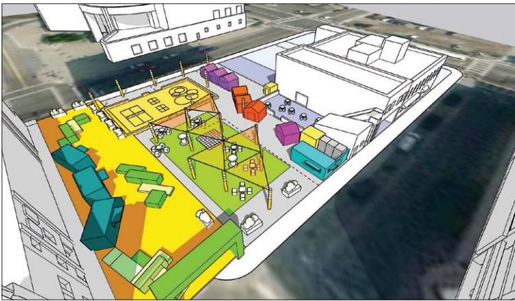
A concept art rendering depicts potential layout of a community hub located on the Polaris Building site.

As Fairbanks city officials and staff plan the future development of the site of the now-toppled Polaris Building and developers begin expressing interest in the location, a long-time urban planner has an ambitious proposal for long-term use of the space. Corey DiRutigliano, a transportation planner with Fairbanks Area Surface Transportation (FAST) Planning, pitched an idea in a brief but thorough presentation at Tuesday's Fairbanks City Council work session. His vision: a central gathering space meant to draw summer and winter activities,