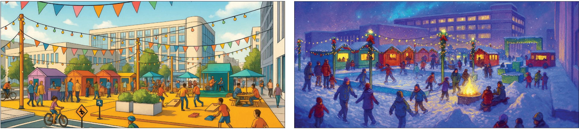
A concept art rendering depicts potential summertime, left, and wintertime, right, activity in community hub located on the Polaris Building site. The community hub was pitched as one possible use of the downtown property if development doesn't occur in the next few years.