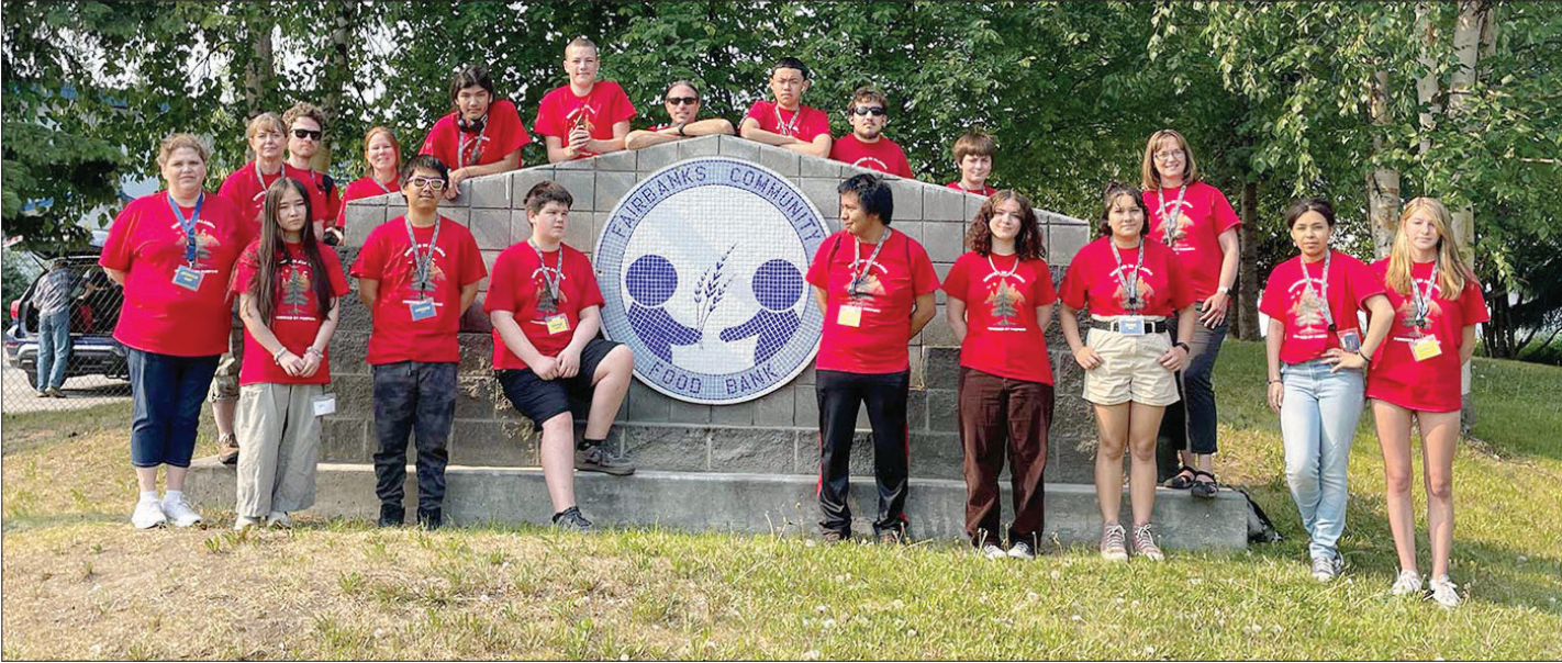
The summer session participants and staff pose for a photo at the Fairbanks Community Food Bank before volunteering their time to package and distribute food.